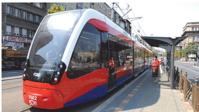
Figure 1. Light rail developed from tram system in Belgrade

The Light rail system is actually either a new railway for local transit or, more frequently, a system developed from tram lines (Figure 1). Many cities are striving to improve the prestige and image of their cities and policies by using the new term "light rail" [3].