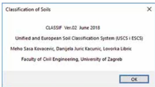
Figure 2. Computer program CLASSIF Ver.02

A new version 2 of the CLASSIF software (Figure 2) has been subsequently developed to take into account novelties in the identification and description of soil according to the European standard EN ISO 14688-1:2018, as well as changes in soil classification principles as presented in the European standard EN ISO 14688-2:2018.